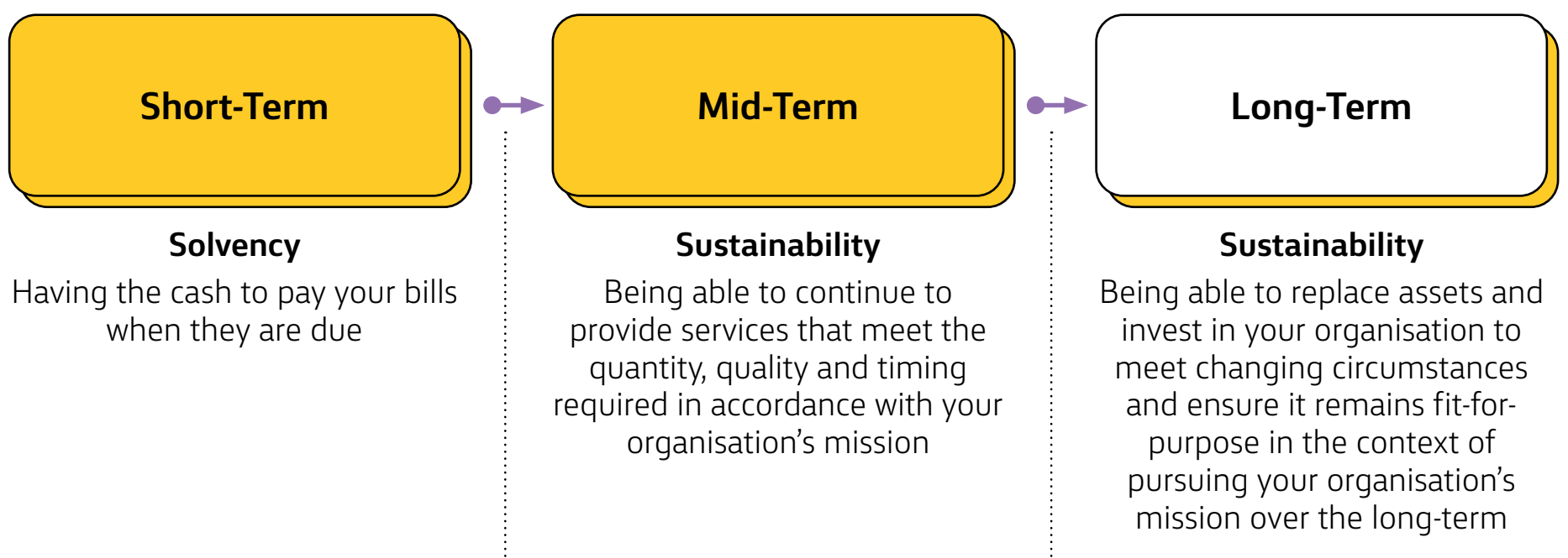
Figure 1: the balance sheet and sustainability

Equity is the difference between the value of all of the assets and liabilities. It can be considered the net wealth or net worth of an organisation. It is this net wealth that is critical in ensuring ongoing sustainability of a not-for-profit organisation over its life. Sustainability is often assessed over three time periods, as described in figure 1 below. Figure 1, Table 1, on page 11, provides a breakdown of the components of the balance sheet and key aspects that are critical to an understanding of this report.